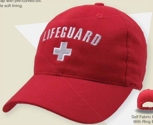
Self Fabric Closure With Ring Buckle