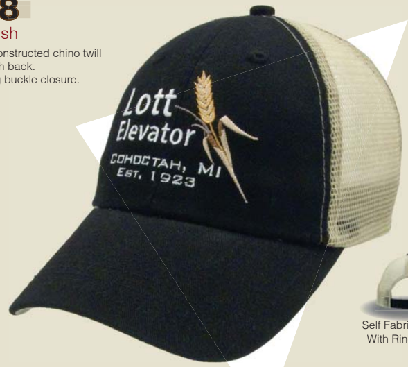
Self Fabric Closure With Ring Buckle